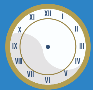
1 HOUR AND 40 MINUTES BEFORE MIDDAY